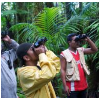
CSP staff searching for the elusive starling.