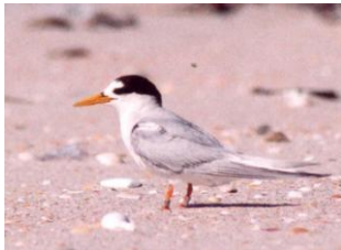
Fairy Tern.

Forest & Bird, BirdLife in New Zealand, is studying the behavior of the Fairy Tern with the aim of gathering information to help secure the future of one of New Zealand's most endangered bird species. The Fairy Tern is listed as (globally) Vulnerable in the IUCN Red List, but the New Zealand subspecies davisae is in much worse condition. Forest & Bird's Karen Baird is coordinating research during the breeding season (i.e. the New Zealand summer) to learn more about the feeding habits of breeding birds, and to track the movements of non-breeding birds. Out of the 43 known Fairy Terns, there are just eight to 10 breeding pairs. The only four known breeding sites are all in the north of the North Island at Mangawhai, Waipu, Pakiri on the east coast and at Papakanui on the western side. The study of the feeding habits of the birds is being done at Mangawhai, where about a quarter of the birds are known to breed. The study tries to find what the breeding birds are feeding on and where they go to forage. The information will be used to try to determine what is needed in the birds' habitat and how to enhance potential breeding sites. "What we are hoping is that we can identify a number of sites which are