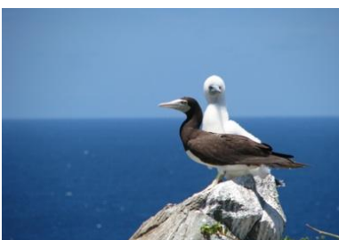
Adult Brown Booby ( Koro ) and chick.

Two years after the BirdLife International Fiji Programme introduced an operation to eradicate rats from the seven Ringgold Islands, off the shores of Taveuni in Fiji, all seven islands have been confirmed rodent-free. Early investigations also show that the birds, people and wider wildlife of these remote islands are already benefitting from the removal of these invasive pests. Located to the northeast of Taveuni, the Ringgold Islands hold internationally important numbers of nesting seabirds. The numbers of Lesser Frigate-bird ( Kasaqa ) on the islands are among the highest in Fiji. The many thousands of Black Noddies ( Gogo ) and large Brown Booby and Red-footed Booby ( Koro ) colonies represent over 1% of the global number for each species, and qualify the island group as an internationally Important Bird Area. However, rats began eating the eggs and chicks of nesting seabirds, seriously affecting these bird populations.