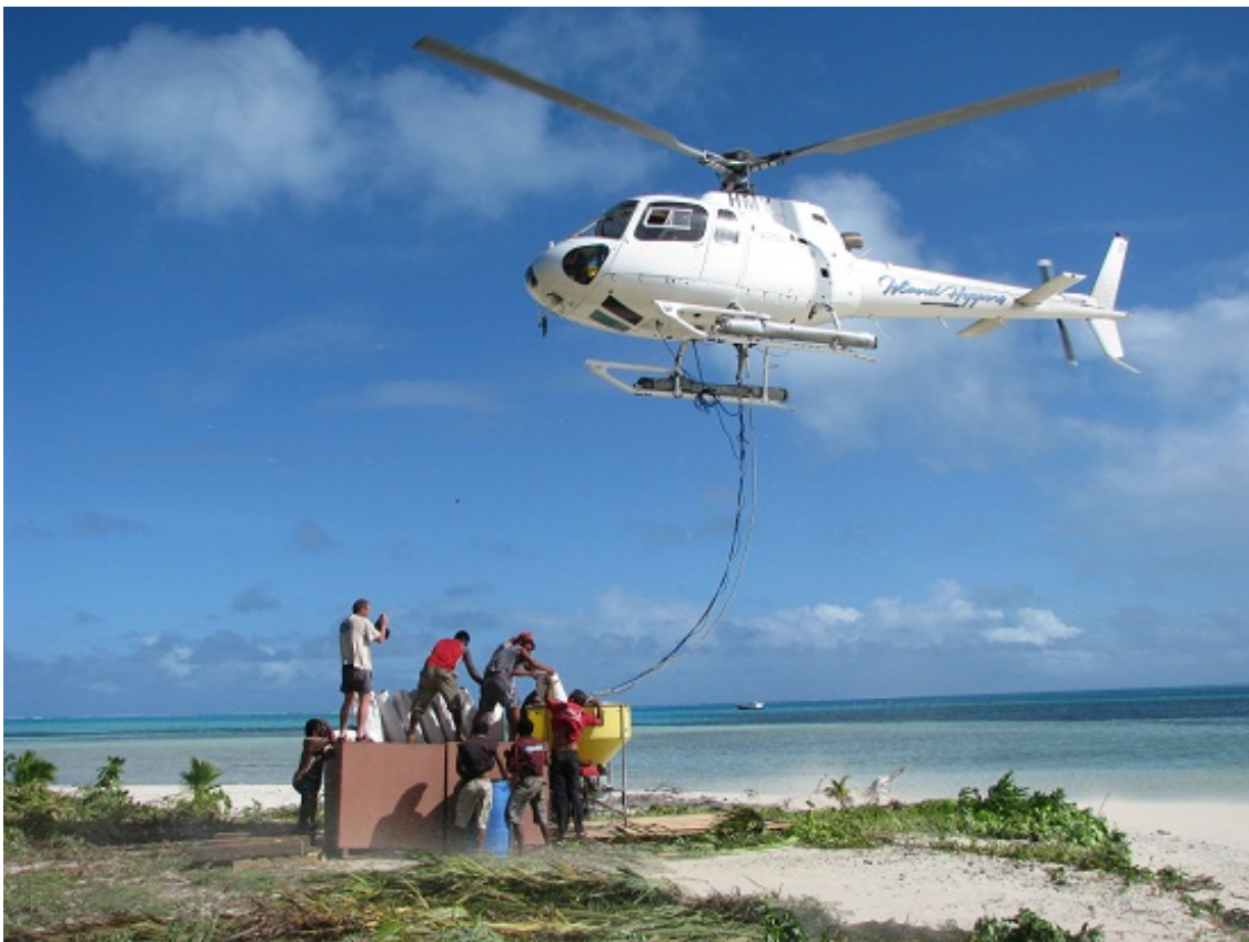
Loading a helicopter with baits to remove rats from islands in Fiji.

The Nagilogilo Clan are now exploring low impact ecotourism opportunities on Vatuira, and BirdLife staff have trained community members in rat eradication, seabird identification and methods for preventing the re-establishment of rats and other introduced species. Local guides are now educating visitors about the importance of stopping rats from returning and how the islands have benefitted from the eradication work.