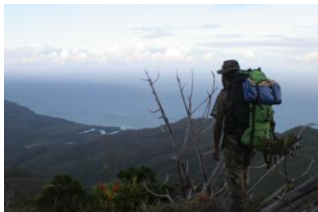
One guide in the field.