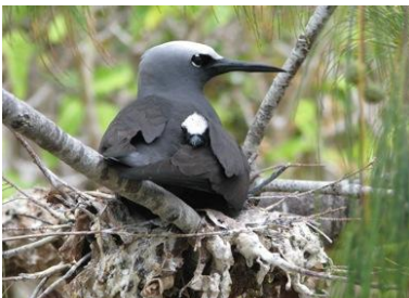
Nesting Black Noddy ( Gogo ) on the rat free Ringgold Islands.