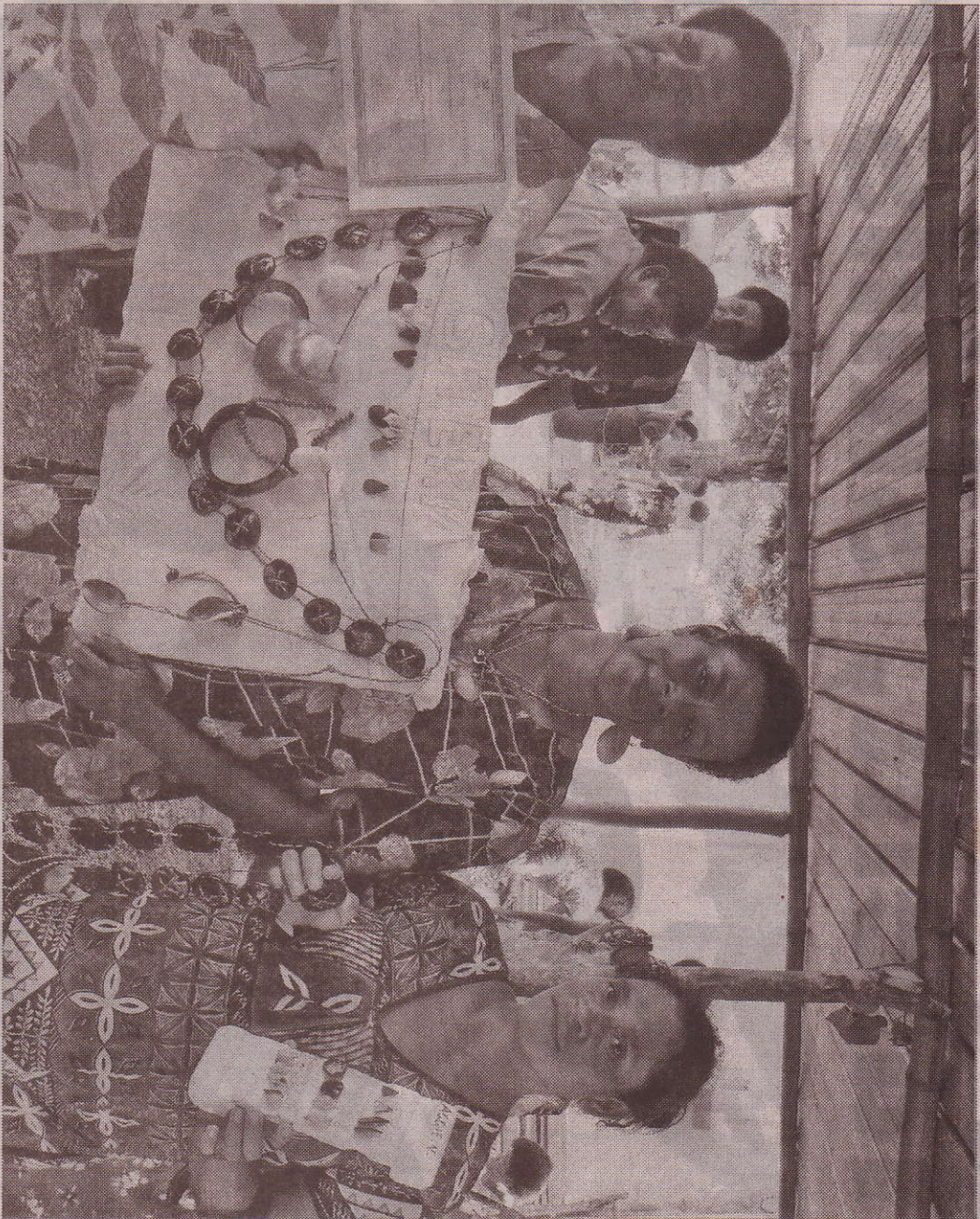
Workshop participants showcase their artwork

Ro Aca said the training helped young women to take up the challenge of developing their cultural and traditional skills into a valuable income source.